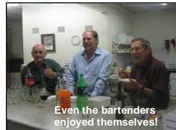
Even the bartenders enjoyed themselves!