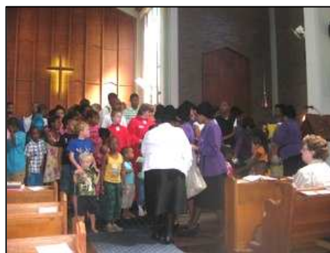
At the 9am service on Friday 5 March and both the 7am and 9am services on Sunday 7 March, the young members of KidZown gave out bookmarks with a prayer for Mothering Sunday to all involved in mothering.

Mothering Sunday , on 7 March, was celebrated in style, with the women of the Mothers' Union handing out "party packs" of sweets to the children (below). After the service, a mouth-watering brunch was on sale for everyone! Thank you, Mothers' Union!!